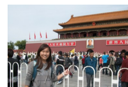
GS Student at Tiananmen Square in China