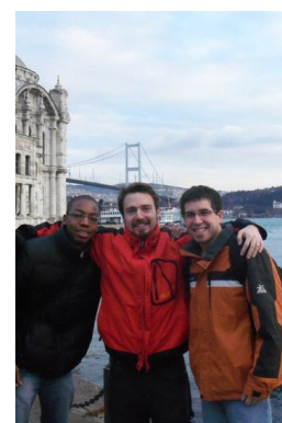
GS Students in Turkey

Remember to apply for the Thulin Scholarship if you're doing research or an internship abroad.