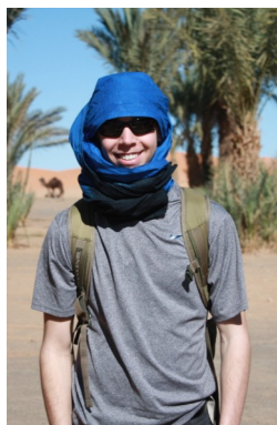
GS Student in the Sahara Desert

Look for ways to become involved outside of the classroom.