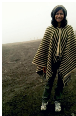
GS Student in Ecuador

Look for ways to become involved outside of the classroom.