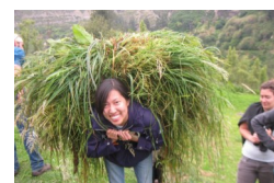
GS Student Volunteering in Ecuador

Discuss your study abroad plans with a Global Studies advisor.