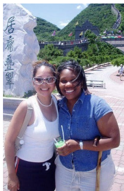
GS Student at Great Wall in China

IS/GS alumni report that study abroad was one of their most valuable experiences as undergraduates.