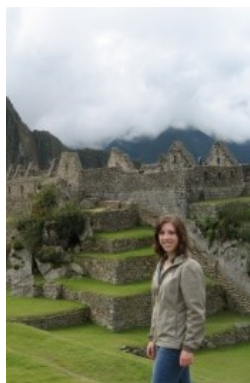
GS Student at Machu Picchu in Peru