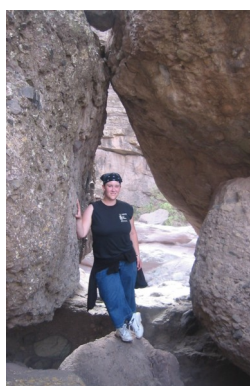
GS Student Trekking in the Andes

IS/GS alumni report that study abroad was one of their most valuable experiences as undergraduates.