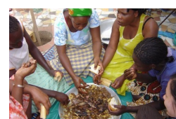
GS Student in Senegal

Plan early for study abroad in order to meet scholarship deadlines.