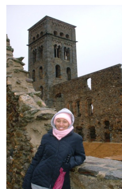
GS Student in Barcelona, Spain