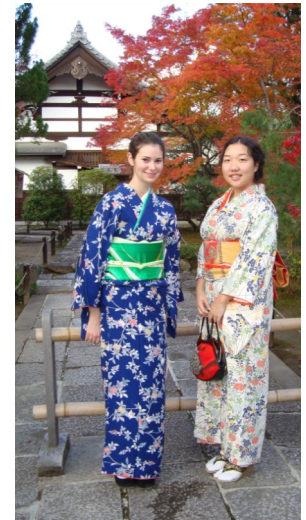
GS Student in Japan

This guide is designed to help GS majors better understand study abroad program options that are appropriate for their semester long study abroad requirement, but does not include optional study abroad experiences like GLBL 298s or summer opportunities.