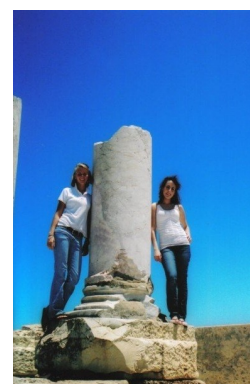
GS Student in Carthage, Tunisia

Discuss your study abroad plans with a Global Studies advisor.