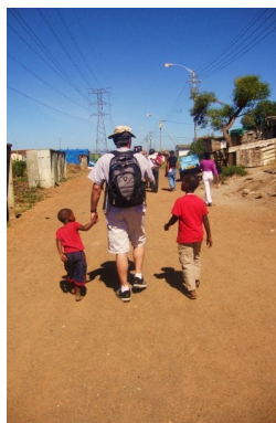
GS Student in Morocco

Read about students' experiences abroad at the Global Studies website.